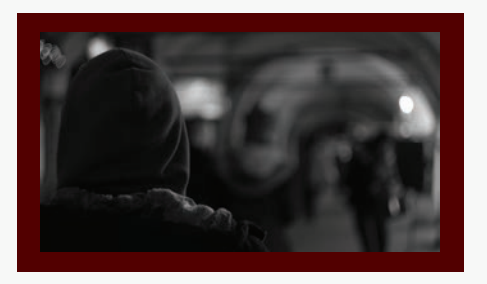
Strategies for Fighting Depression Well—by Jim Newheiser https://biblicalcounseling.com/fighting-depression-well/